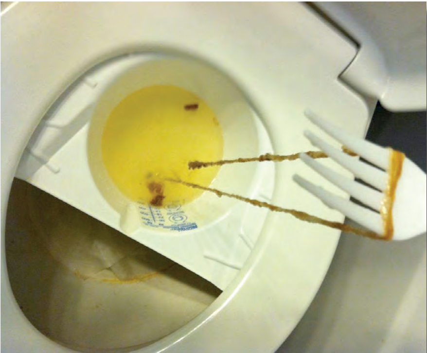
This is a 32-inch parasite that a young boy passed. He went on to have a great day after getting this out.