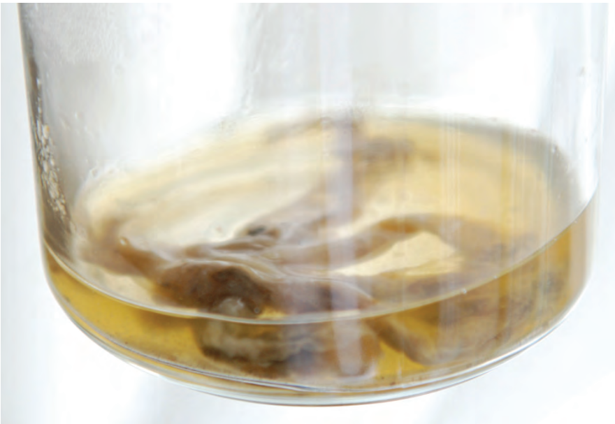
The same parasite (as above) from a different angle.