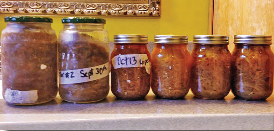
7 lbs. of 35 lbs. (total) of the parasites extracted in 9 months (160 feet in total above).