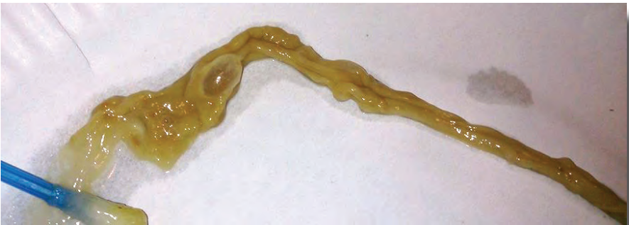
The bubble visible in this photo leads us to believe this is a late stage rope worm.