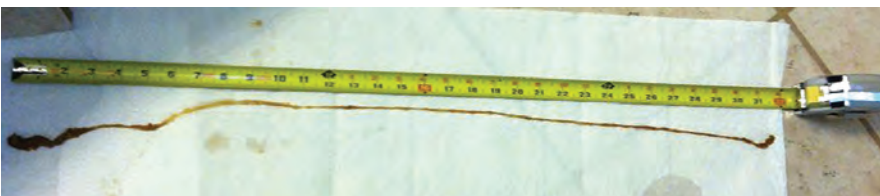
This is the parasite that measured 32 inches.