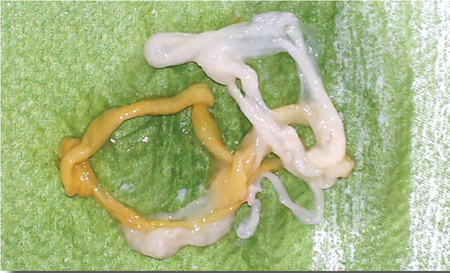
A great photo of a dead parasite, believed to be the Ascaris lumbricoides , or possibly a rope worm in the “seaweed” stage.