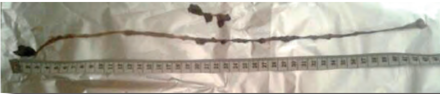
A very good look at how long some helminths are. The more worms the people pass, the healthier they get, and the improvements come faster and faster. This child passed a lot of parasites in the beginning. Then after a few months was no longer passing them and now has an ATEC score of 5. Meaning, he no longer has the diagnosis of autism.