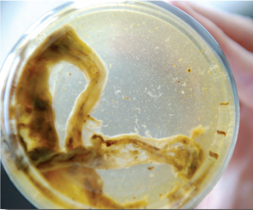
A really good look into a parasite. You can see the actual intestines of the parasite. Also known as a helminth.