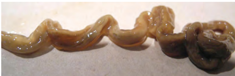
A well washed parasite. You can almost feel the texture.

In addition to Ascaris and rope parasites, parents have also seen hookworms, pinworms, tapeworms, and flukes, among others. This is an extremely important piece of the puzzle for so many of our children. We have been led to believe that in first world nations, parasites are not a problem. This is absolutely not the case.