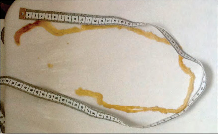
Another long, well washed parasite for the collection. The road to recovery is paved with many dead parasites. Adios Autism...