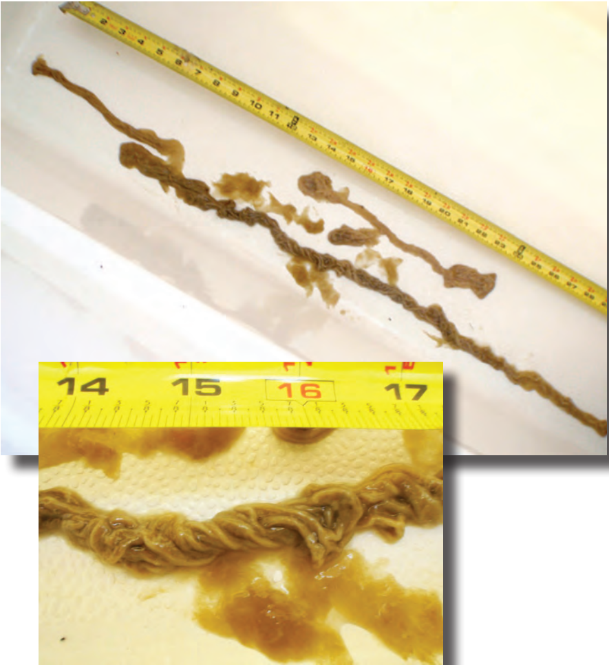
This 33 inch parasite (aka “Chester”) was discovered by a woman using the protocol on herself.