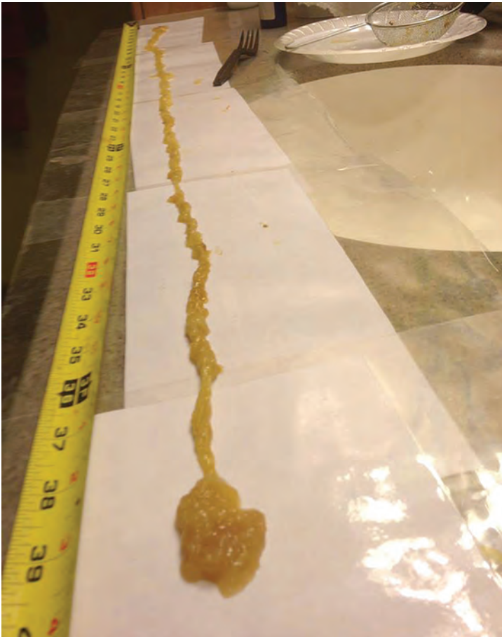
39+ inch long worm.